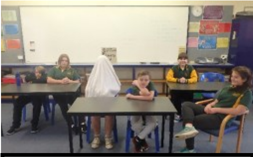
The cast of Ghost at the Gifford School