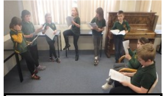
Script reading session with Year 3/4s