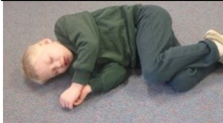
A dog asleep under a tree

I enjoyed listening to and imagining the stories. Jedd I've learnt to be brave and do acts with other people and perform in front of other people. Amber I liked trying to act as a different person and using the voice of the character. Zarah-Dusk